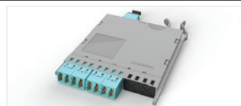
Legacy EDGE™ Housing Compatibility