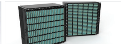
EDGE8 Port Replication Housing