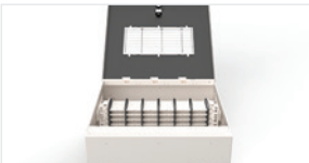
Overhead and Subfloor Distribution