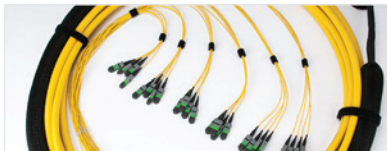
EDGE8 High-Fiber-Count Trunks