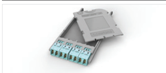
EDGE8 LC Panels