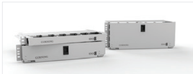
EDGE8 FX Housing