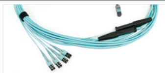
EDGE8 Hybrid Trunks