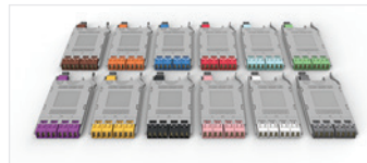
EDGE8 Secure Solutions