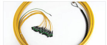
EDGE8 Armored Trunks