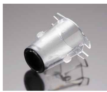
Corning FluoroBlok 6.5 mm insert