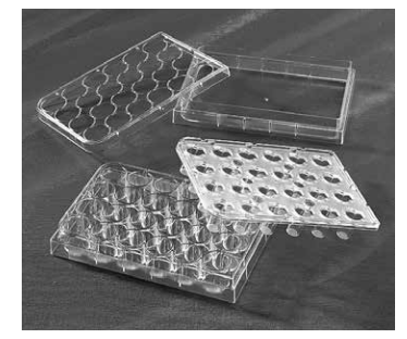
HTS Transwell insert plates