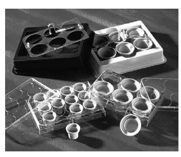
Polyester Netwell inserts