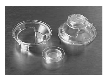
Polyester Snapwell inserts