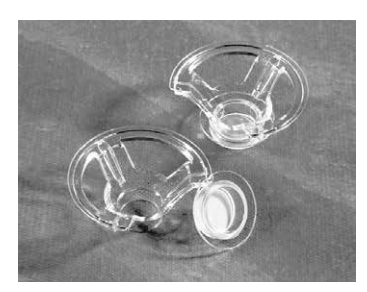
Polycarbonate Snapwell inserts