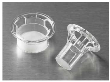
24 and 6.5 mm Transwell inserts