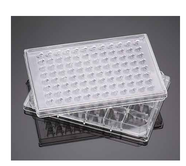
Falcon HTS insert plates