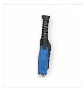
MDC Senior Connector