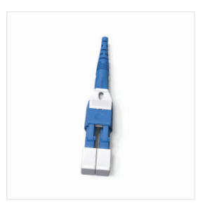
Lockable LC Duplex Uniboot LC Duplex Uniboot