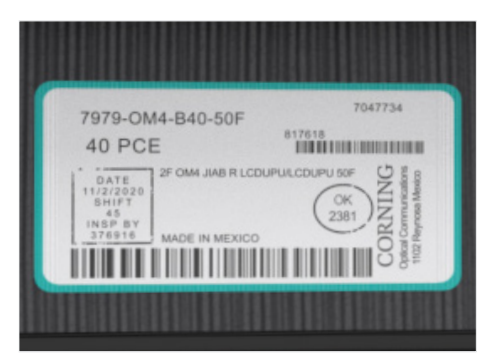
Part number identification at a glance

Self-tracking inventory count on each bag