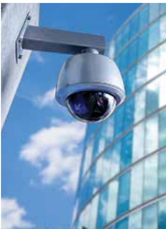
Outdoor Security Camera

Whether you're looking to deliver reliable wireless access or create a safer environment, we can help. Learn more about our remote power solution at corning.com/remote-power .