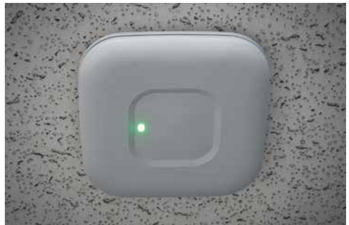
Remote Wireless Access Point