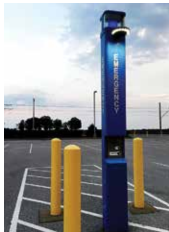
Emergency Call Box Security System