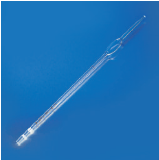
PYREX® Ostwald-Folin blood chemistry pipets must be carefully cleaned to ensure their accuracy.

To remove particles of coagulated blood or dirt, a cleaning solution should be used. One type of solution will suffice in one case, whereas a stronger solution may be required in another. It is best to fill the pipet with the cleaning solution and allow it to stand overnight. Sodium hypochlorite (laundry bleach) or a detergent may be used. Hydrogen peroxide is also useful. In difficult cases, use concentrated nitric acid. Some particles may require loosening with a horse hair or piece of fine wire. Take care not to scratch the inside of the pipet.