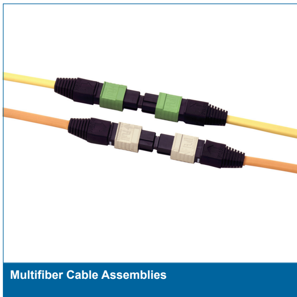
Multifiber Cable Assemblies

Corning provides an extensive line of high-performance fiber cable assemblies. The 752 Series of Multifiber Cable Assembly products offer state of the art performance with superior repeatability and low loss. All Corning assemblies are fully intermateable with any standard coupling adapter products and are highly stable under a wide range of application conditions. The 752 Series utilize high quality MT ferrule connectors to ensure consistent low loss and reliability. We offer both multimode and single-mode grade products.