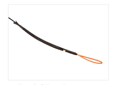
Inside End of Clear Fiber Drop Patch Cord with Pulling Sock