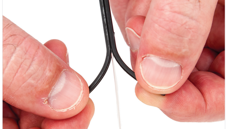
Clear Fiber Drop Cable