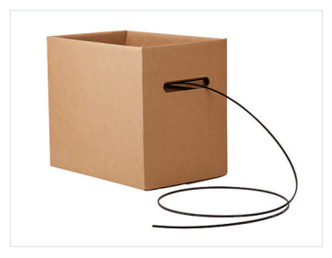
Clear Fiber Drop Cable (Unterminated, indoor/outdoor)

Like the Clear Fiber Drop patch cord, the Clear Fiber Drop pigtail cable is available as a factory-terminated pigtail solution with an SC APC connector located on the exterior end. The outdoor end of the Clear Fiber drop pigtail has an SC APC connector and the fiber is transitioned to a round 3 mm jacketed cable, which can be easily looped inside a network interface device (NID).