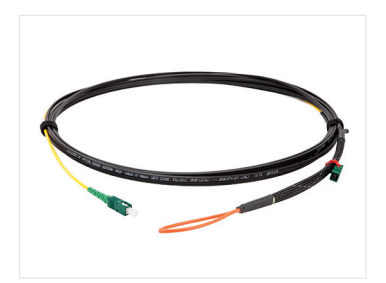
Clear Fiber Drop Patch Cord