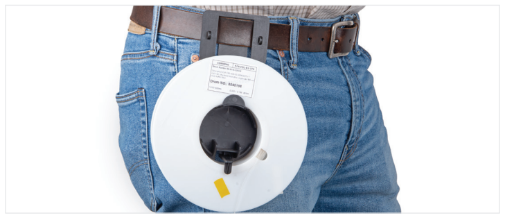
Belt Clip Spool Holder with 900 \mu m Clear Fiber Spool Installed