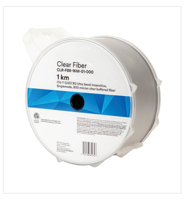
900 μm Clear Fiber, 1 km Spool ITU-T G.657.B3 Grade

Glass cladding diameter 125.0 \pm 0.4 \, \mu m Glass core/cladding concentricity error \leq 0.3 \mu m Glass core/cladding non-circularity ≤ 0.3% Clear Fiber buffer diameter 0.9 \pm 0.05 \, \text{mm} 2F Micro Module diameter 0.9 \pm 0.1 \, \text{mm} Coating diameter 242 \pm 5 \mu m