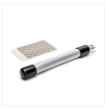
Clear Track Hallway/ILU/Quad Wall Compatibility Test Weight and Test Strips