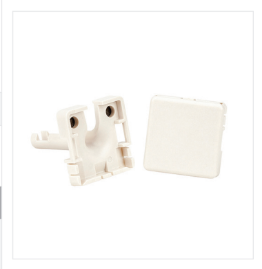
Micro Point-of-Entry Wall Cover