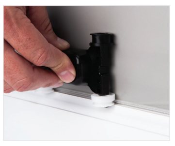
900 \mu m Clear Fiber into ILU Fiber Pathway with ILU Installation Tool