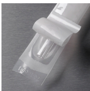
Clear plastic wrap