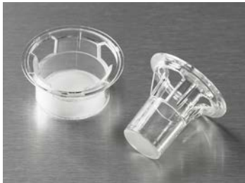
24 and 6.5 mm Transwell inserts

Corning offers four types of individual inserts: