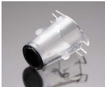
Corning FluoroBlok 6.5 mm insert