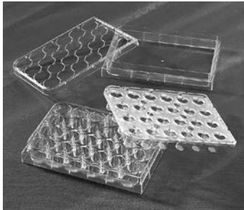
HTS Transwell insert plates