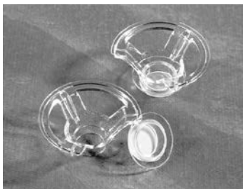
Polycarbonate Snapwell inserts