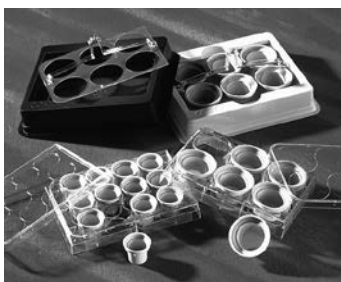
Polyester Netwell inserts