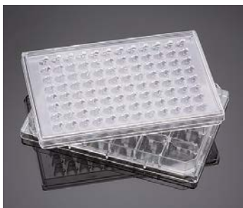
Falcon HTS insert plates