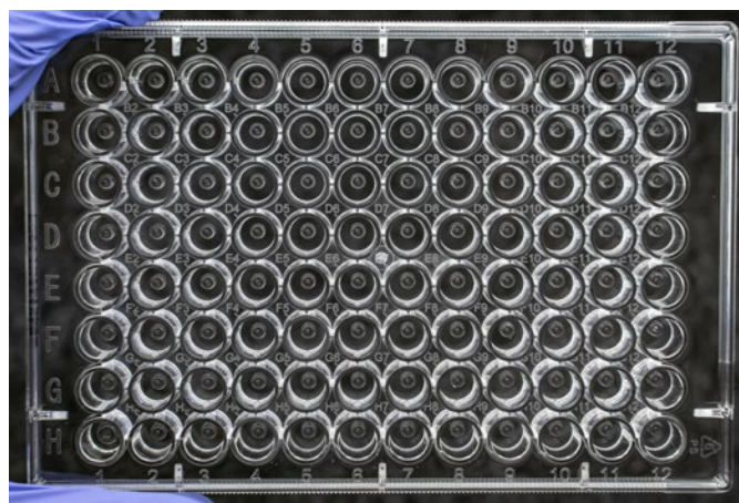
Figure 1. Droplets of Corning Pluronic sacrificial ink without cells dispensed in a 96-well microplate, using the parameters in Table 1.