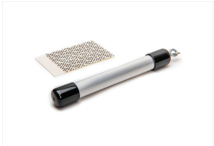
Clear Track Wall Compatibility Test Weight and Strips