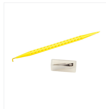
Clear Track Hallway Fiber Access Toolkit