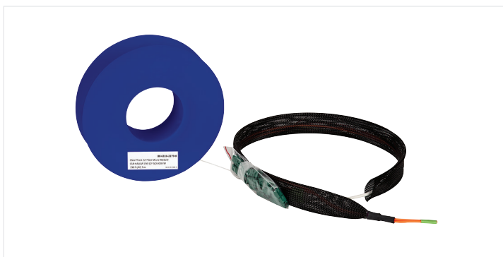
Clear Track 12-Fiber Micro-Module Spool Connectorized with SC APC Connectors and Pulling Grip