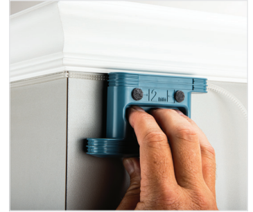
Installation of Hallway Fiber Pathway with Clear Track Hallway Universal Installation Tool