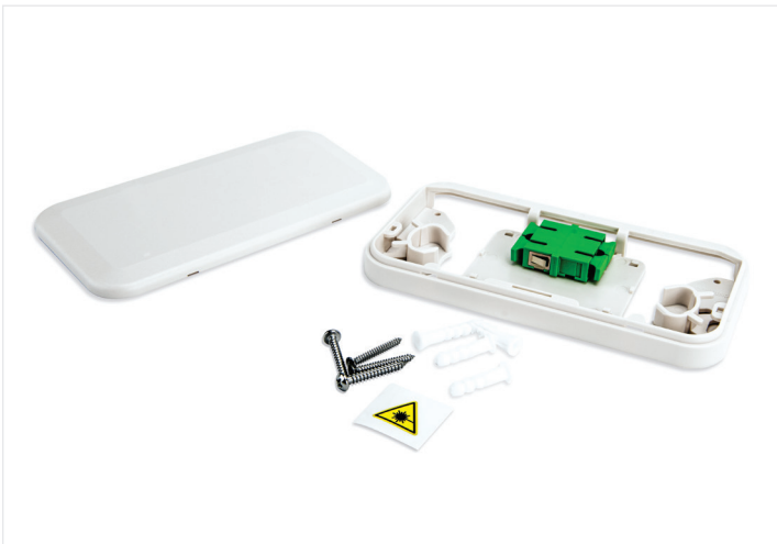
Hallway POE (Point of Entry) Equipped with Duplex SC APC Adapter

Glass cladding diameter 125.0 \pm 0.4 \mu\text{m} Glass core/cladding concentricity error \leq 0.3 \mu\text{m} Glass core/cladding noncircularity \leq 0.3\% Inked coating diameter 242 \pm 5.0 \mu\text{m}