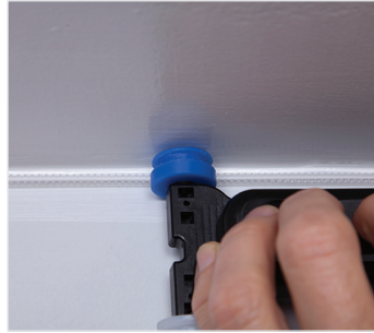
Installation of Clear Track Hallway Fiber Pathway with Hallway Installation Tool