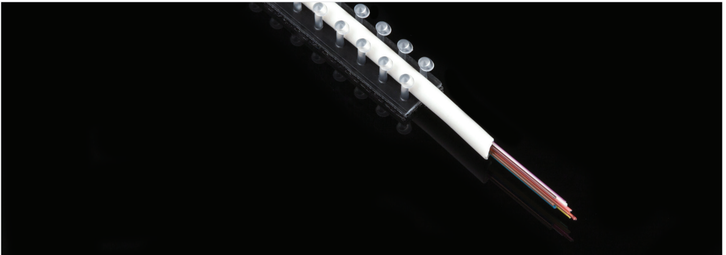
Clear Track Hallway Fiber Pathway With Clear Track 12-Fiber Micro-Module

*The adhesive backing is meant to be for permanent bonding to the surface and therefore removing it from the wall will damage paint or wallpaper.